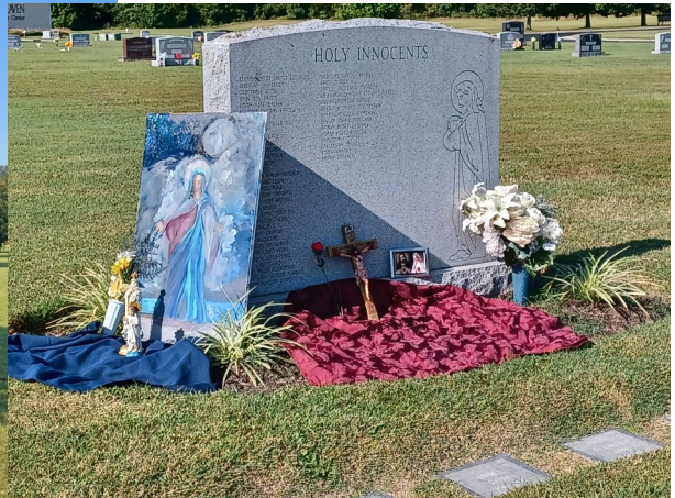
Day of Remembrance at memorials in Dagsboro, Wilmington, and Dover, 9/13