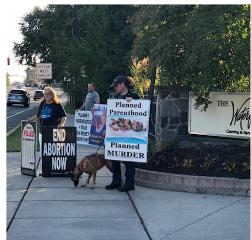
Protesting the Planned Parenthood Fund-raiser in Claymont, 9/18