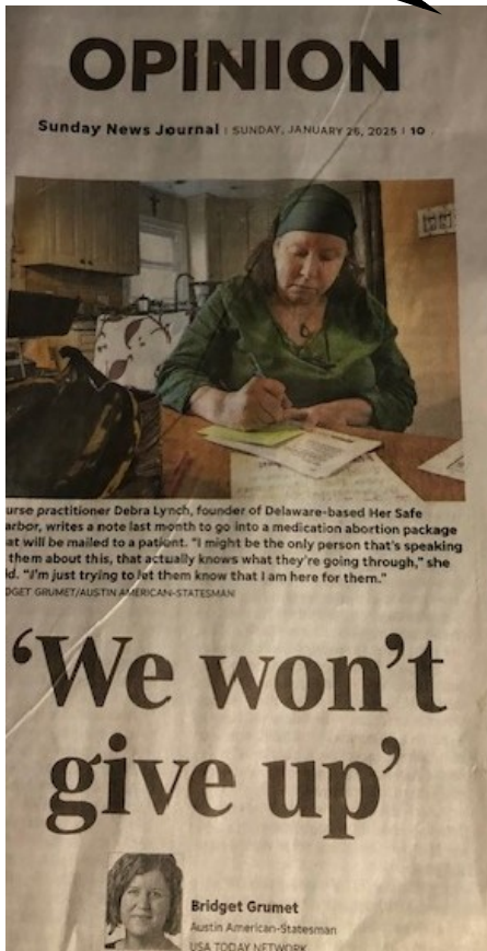
News Journal reprint of an article (1/25/25) glorifying the dangerous practice of distributing abortion pills by mail without medical oversight. Delaware's "shield law" protects such people from prosecution.