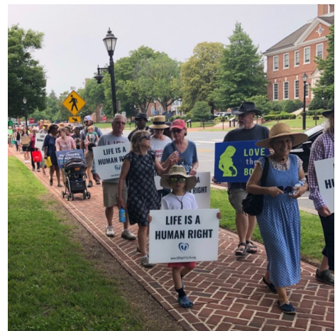
Walkers hold signs showing they value life.