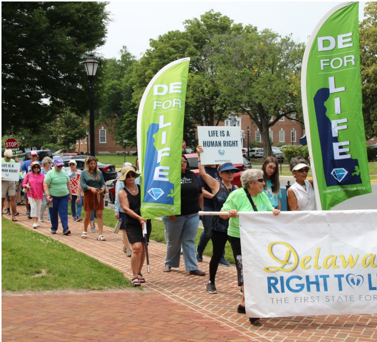
Banners flying, about 100 attendees make their way along the Green in Dover at the DRTL June 5 Walk for Life

Almost 100 people showed up on a hot, sunny day to walk in remembrance of the thousands of babies aborted each year in the First State. From the Liberty Bell on Dover's Green to the steps of Legislative Hall, they ambled in the heat, some carrying signs, some shade umbrellas, but all unflagging in their support of life. At the end of the Walk at the East Steps, they were met with the stirring sight of hundreds of pairs of baby shoes displayed on the steps showing just a fraction of the impact of abortion in Delaware.