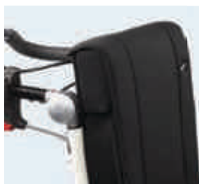
Back extension cushion 95743-xxx Supports the upper back

See the Accessories section at the back of the catalogue, for further information on options and measurements