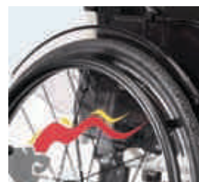
Mud guards 9520xx Available for 20", 22" and 24"