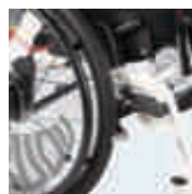
Wheel brakes (available for 20", 22" and 24")

Choose from the different types of brakes