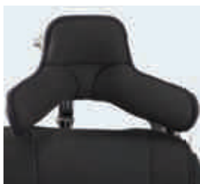
Head support with cover 99xxx-xx For correct position and support

See the Accessories section at the back of the catalogue, for further information on options and measurements