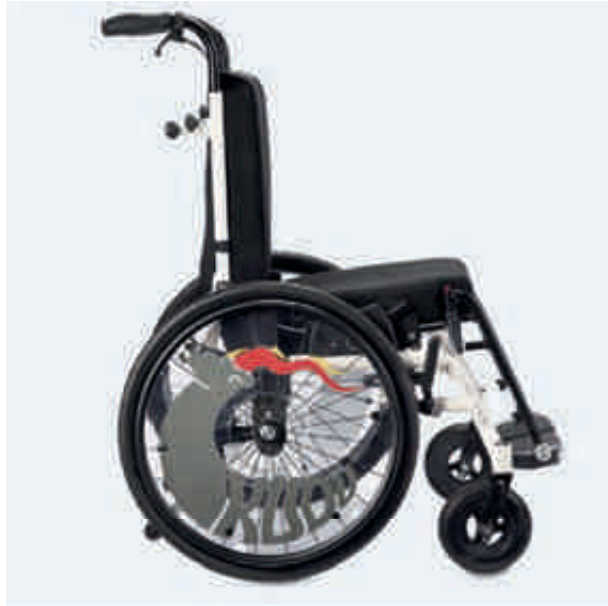
Kudu with push handles and wheel brakes