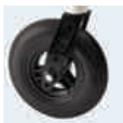
7" solid or air front wheels (can be combined with 22" and 24" rear wheels)