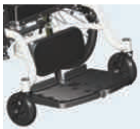
Calf support 85131 Centrally mounted foot plate For extra support and comfort