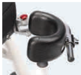
Swing-away knee supports, set 95860-xx Provide control and positioning

See the Accessories section at the back of the catalogue, for further information on options and measurements