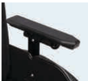
Arm rests, incl. side plates 95712x Height adjustable and provide arm support

See the Accessories section at the back of the catalogue, for further information on options and measurements