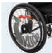
20"/22"/24" solid or air