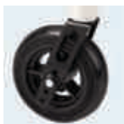
6" solid front wheels

Choose from the different sizes of front wheels