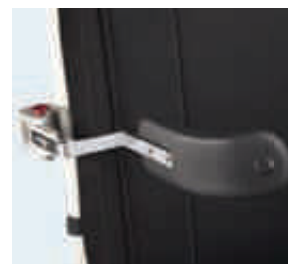
Swing-away side supports 8310xx-xxx

See the Accessories section at the back of the catalogue, for further information on options and measurements