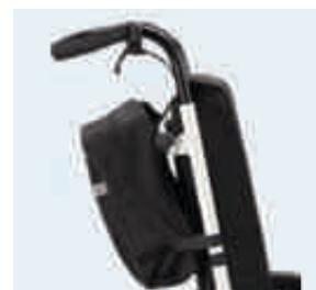
Rucksack 94480-x Extra space for storage