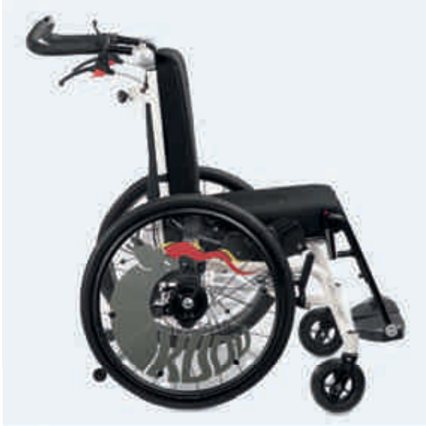
Kudu with push brace, drum brakes and wheel brakes

The Kudu is available in four sizes. Can be ordered with either push handles or angle adjustable push brace