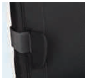
Fixed side supports 95401-x0