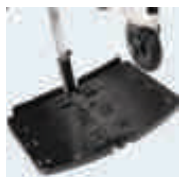
Foot plate, centrally mounted

Choose from the different types of foot supports