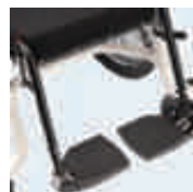
Parted foot rests (available for size 2+3+4)