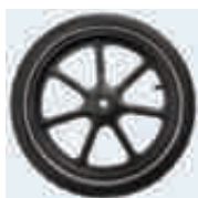
12½"/16" solid or air

Choose from the different sizes of rear wheels. 20", 22" and 24" come as standard with quick release