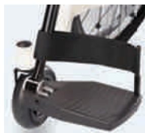
Heel band for parted foot rests 85132-xx