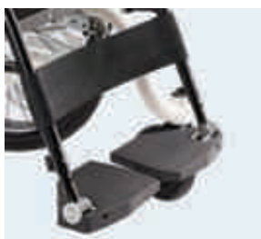
Calf support 85131-xx For parted foot rests For extra support and comfort