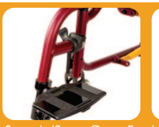
Swing-In/Swing-Out & Fixed Hanger Options

Allows controlled movement of the backrest to help maintain proper user positioning and reduce wheelchair damage.