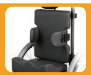
JAY® Seating Options

VersaRail makes ordering simple by offering one seat rail system that is compatible with JAY Zip seating, JAY made to order seatina, and slina upholstery.