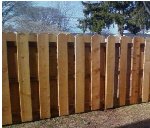
Front of Privacy Fence